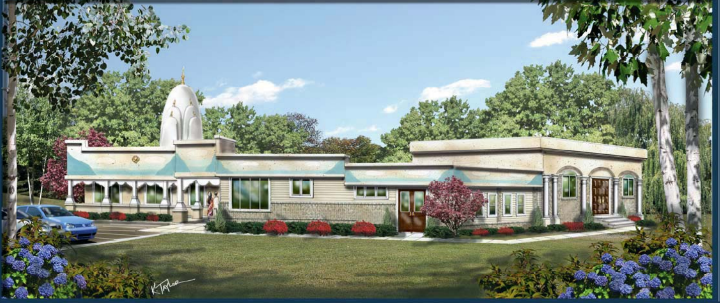
Shri Sanatan Mandir Parsippany, New Jersey Planned Improvements - 2009

Please be sure to fill out the donation pledge form inside and send it back to us now! Thank you for your generosity!